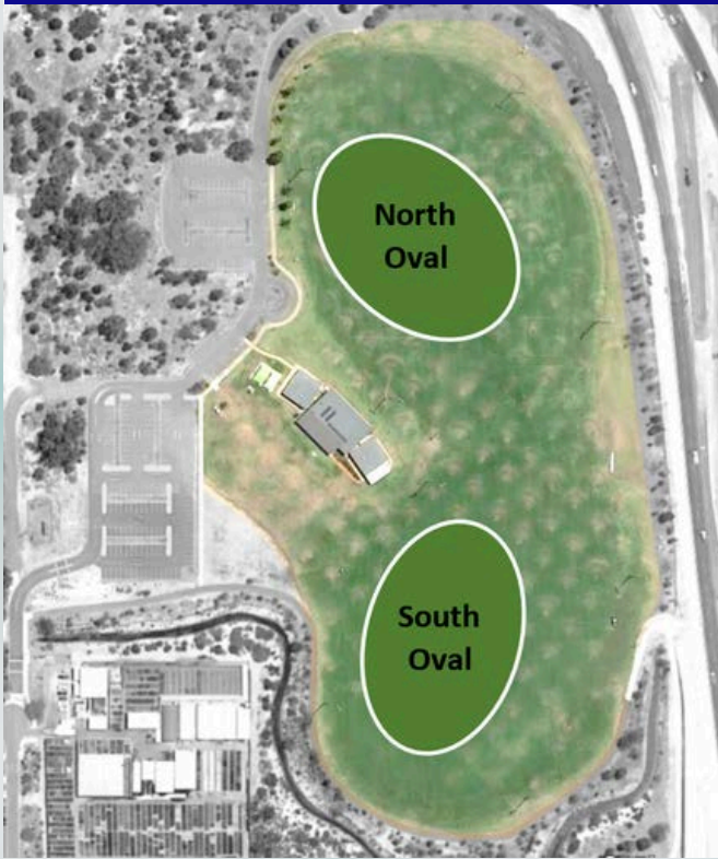
LIGHTNING PARK Della Road Noranda