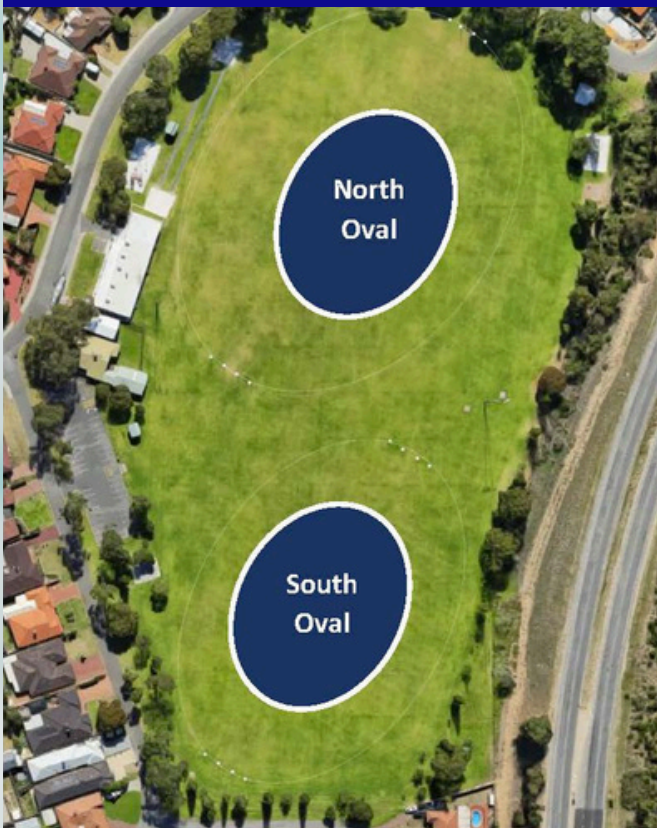
SANTICH PARK 19 Beckett Close, Munster