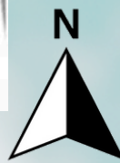
SANTICH PARK 19 Beckett Close, Munster